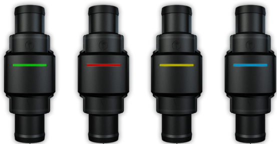
OK ALARM (Blockage) (Error) WARNING (Clean) FIRMWARE UPDATE