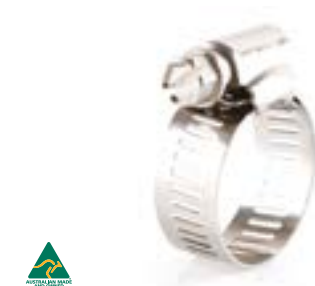
Perforated Band Clamps All stainless steel for corrosion protection

Be prepared this seeding season with these handy items, available at your local Case IH dealer.