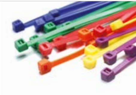
Cable Ties - Coloured Easy identification and tagging