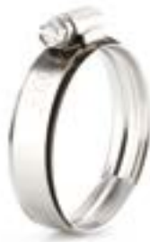
Layflat Clamps For blue lay flat hose