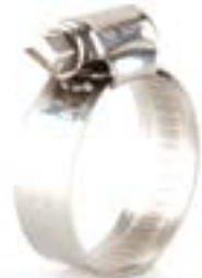
Multi Purpose Clamps All stainless steel for corrosion protection