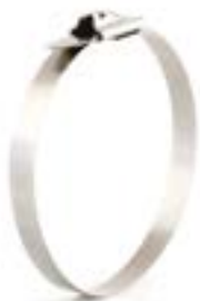
Stainless Steel Cable Ties All stainless steel for corrosion protection