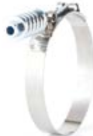
Spring T-Bolt Clamps Heavy duty spring loaded