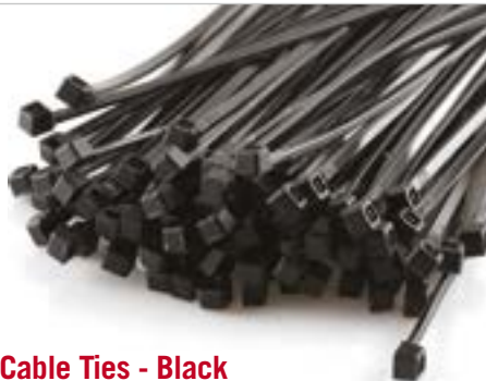
Cable Ties - Black UV stabilised