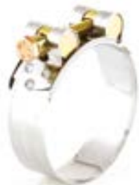
T-Bolt Clamps Heavy duty applications