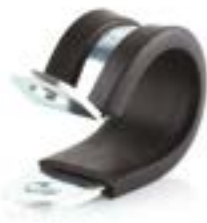
Rubber Lined Clamps Secure pipes, hoses, tubing etc.